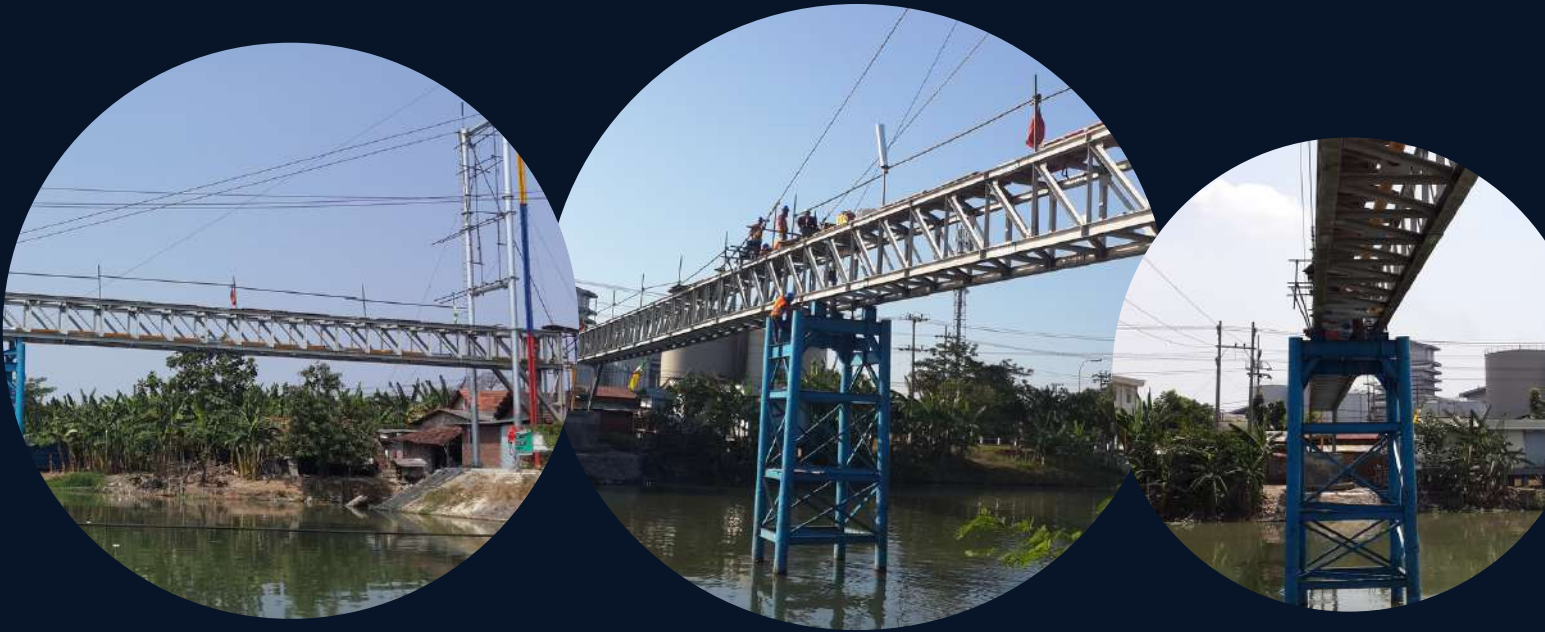
SURABAYA PIPE BRIDGE - 2014