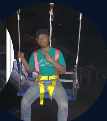
ADRENALINE SWING (ANCOL 2019)