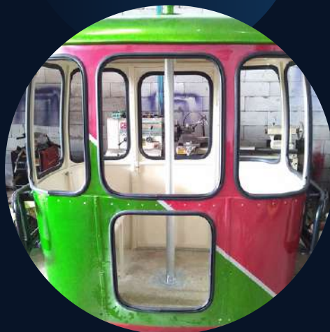
TAMAN SAFARI (2016)