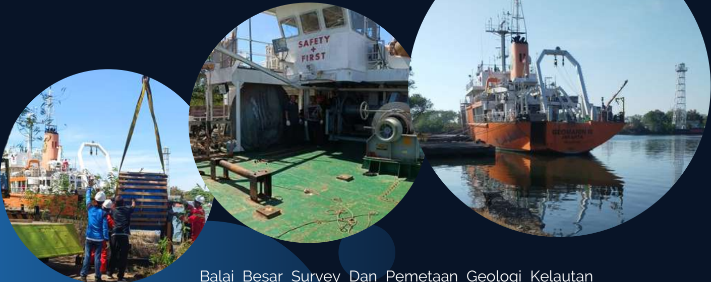
Balai Besar Survey Dan Pemetaan Geologi Kelautan Bandung (Cirebon Site - 2023)