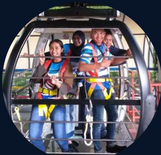
ADRENALINE CABIN (ANCOL 2019)